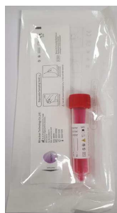
Naso-oro-pharyngeal swab + Transport medium 3ml